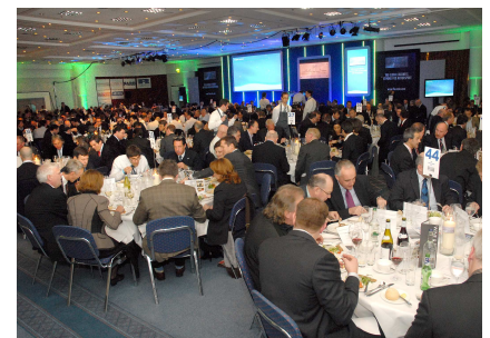
Awards Dinner 2010

Motorsport Industry Association Federation House Stoneleigh Park Warwickshire CV8 2RF UK Tel: +44 (0)2476 692 600 Fax: +44 (0)2476 692 601 email: info@the-mia.com web: www.the-mia.com